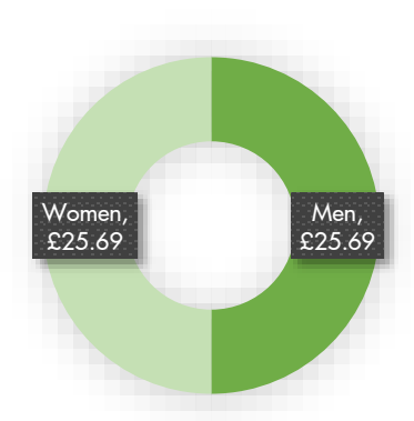
Median (middle) There is 0% difference